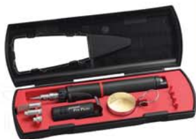
Pro Piezo Kit