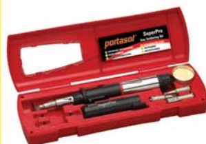
Super Pro Kit