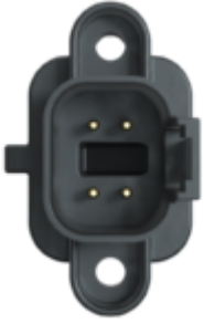
Built-in Deutsch DT-4 (4-pin)